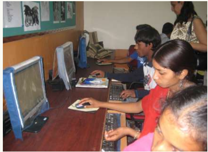
HOH Computer Lab

making a difference... one child at a time