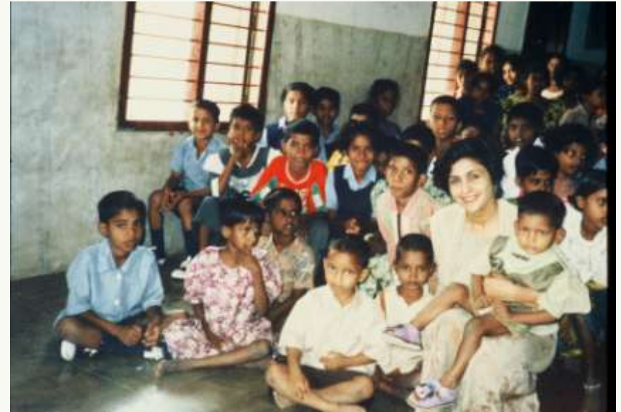
My first visit to CHOH, 1998

making a difference... one child at a time