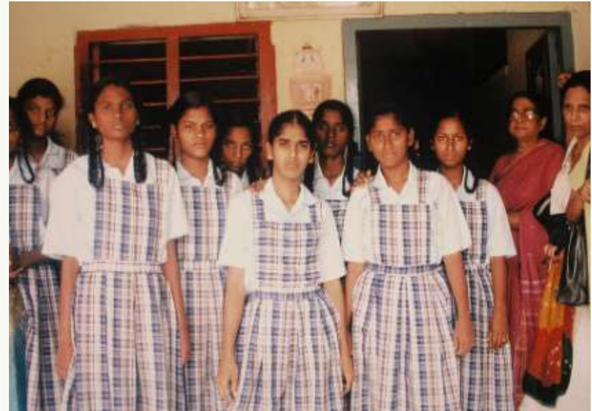
Kids going for higher education

making a difference... one child at a time