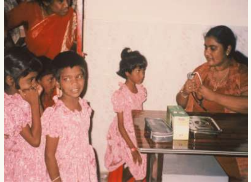
Free Medical Clinic

making a difference... one child at a time