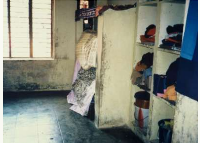
Cramped living conditions

making a difference... one child at a time