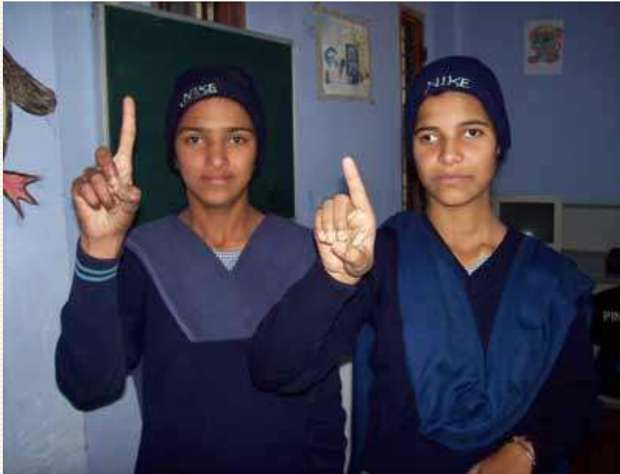
The gift of sign language