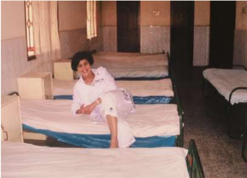
No sick child!