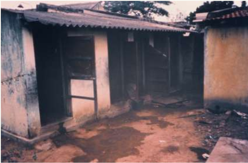
Dilapidated tin-shed bathrooms