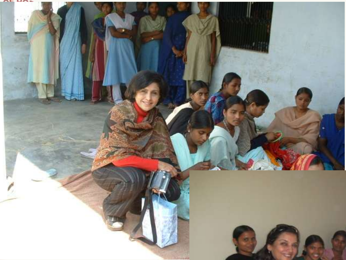
making a difference