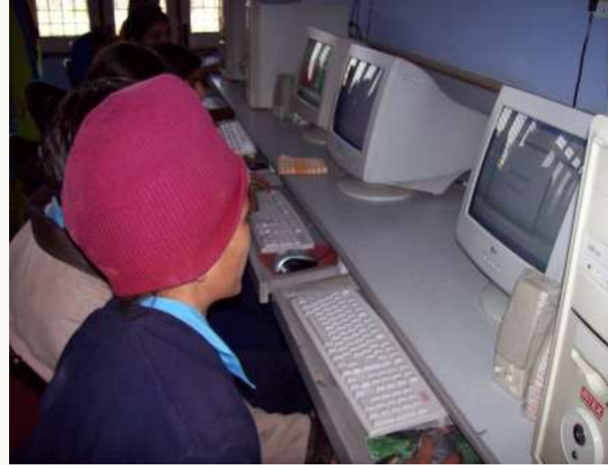
Special Computer Lab

making a difference... one child at a time