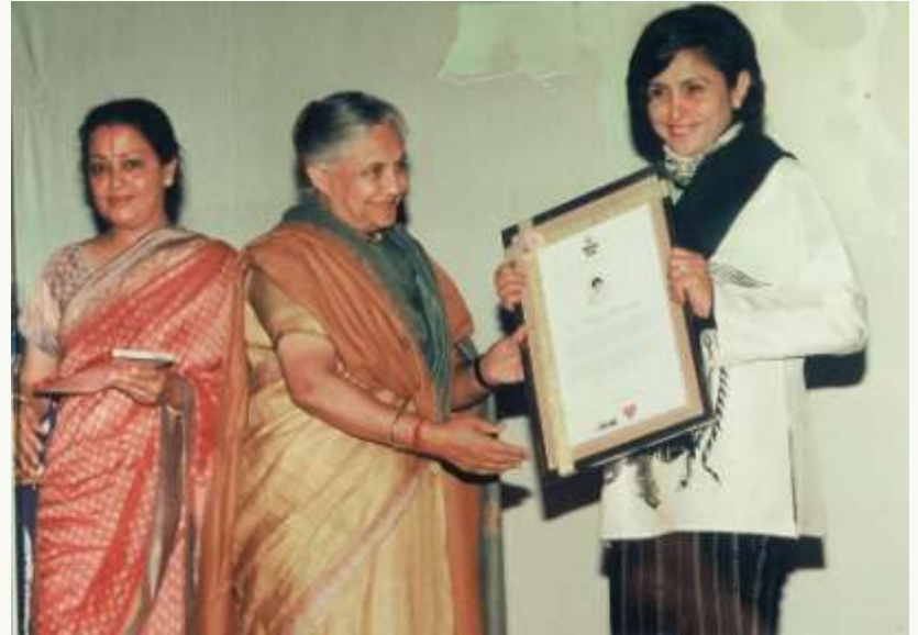
HOH receives award from Chief Minister, Delhi

making a difference... one child at a time