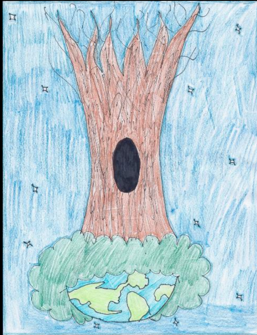
Illustration by Niharika Desiraju