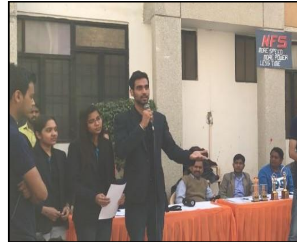
Poornima college of engineering