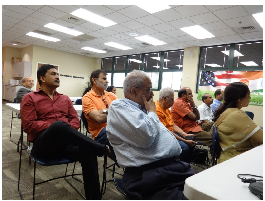
Some Participants Listening Intently