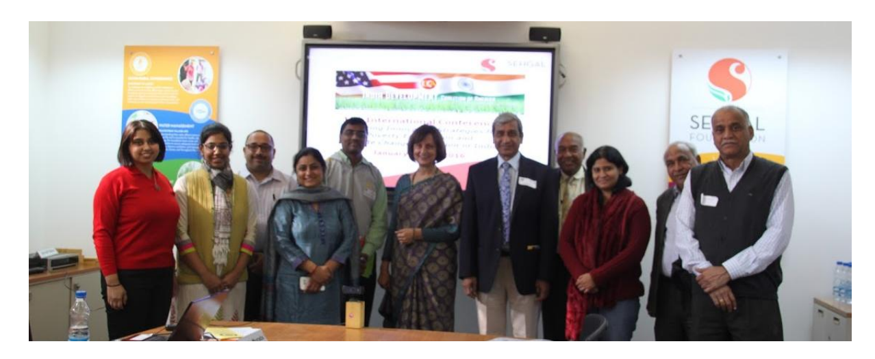
THANKS FOR YOUR PARTICIPATION!