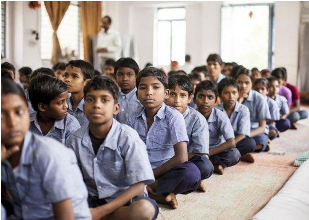
Children at our Education Center